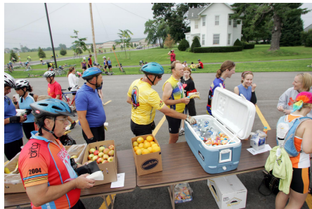
Hawkeye Park Concession Stand RIDE RIGHT Meeting (Town Hall-style RAGBRAI Forum) 9:00 a.m. – Meeting (Gatorade, Water & Snacks Provided)