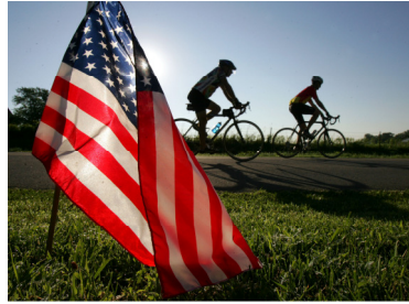
High Trestle Trail (Ankeny to Woodward) Fun Ride Starts: 10 a.m. (Look for the Water Tower!)