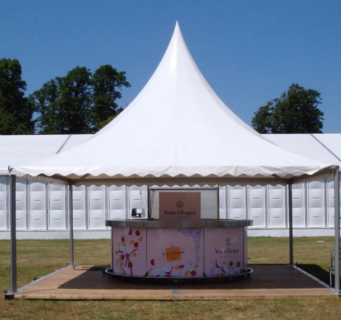
Circular style bar without a canopy

At the center of the Tipico Zone stands a fully branded custom-built circular bar. The zone will be in a prime location in the middle of the post-race festival at all Rugged Maniac events. At RAGBRAI, it will enjoy top billing at the main expo, which kicks off the event, as well as at each daily expo, immediately outside the nightly concert venue.